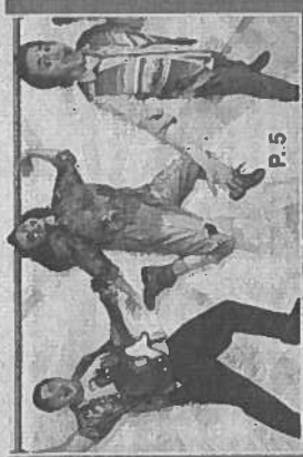
Complete Works of Shakespeare P. 5